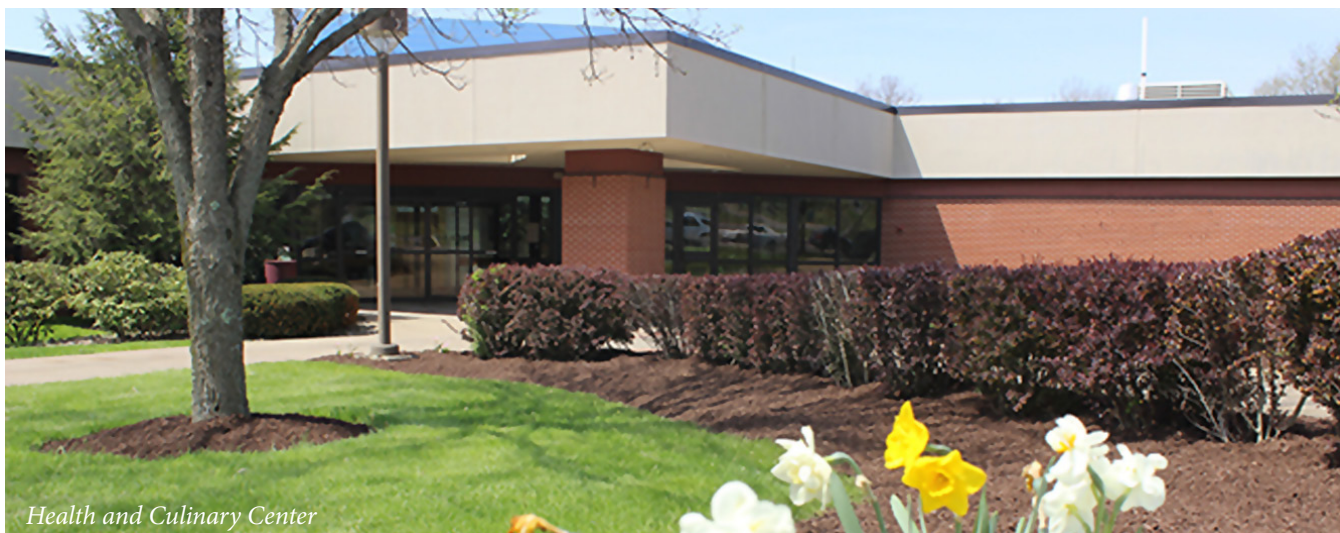
Health and Culinary Center

facility. Several multipurpose rooms provide settings for a variety of conferences and seminars for business and industry. The Health and Culinary Center is also home to five High-Fidelity Nursing Simulation Labs.