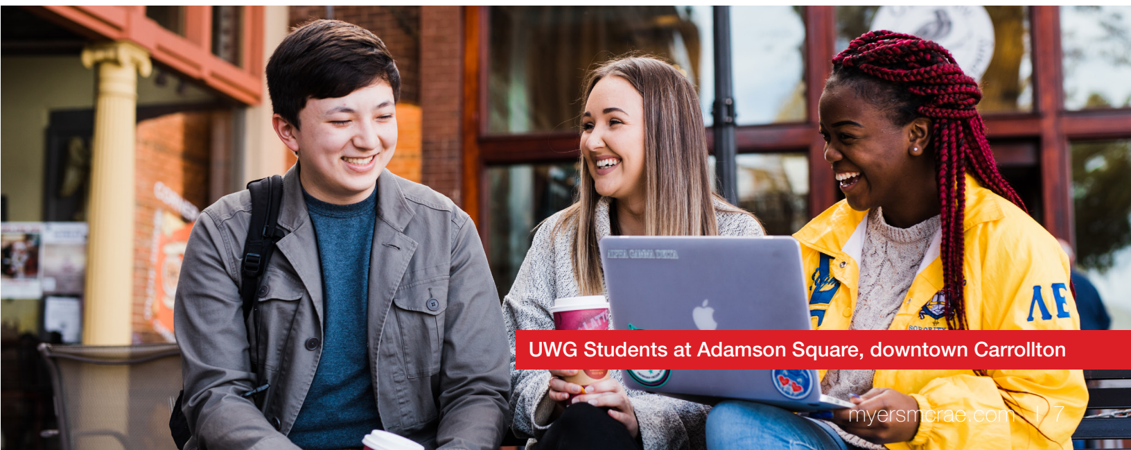
UWG Students at Adamson Square, downtown Carrollton