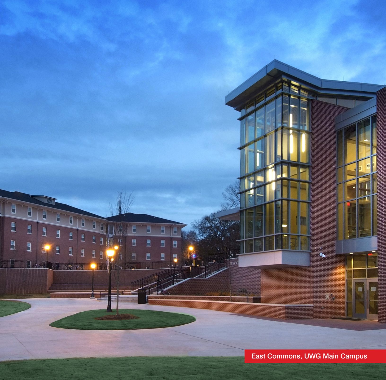
East Commons, UWG Main Campus