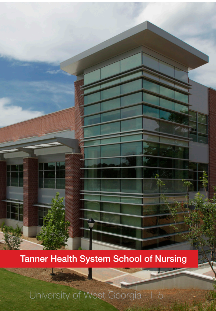
Tanner Health System School of Nursing