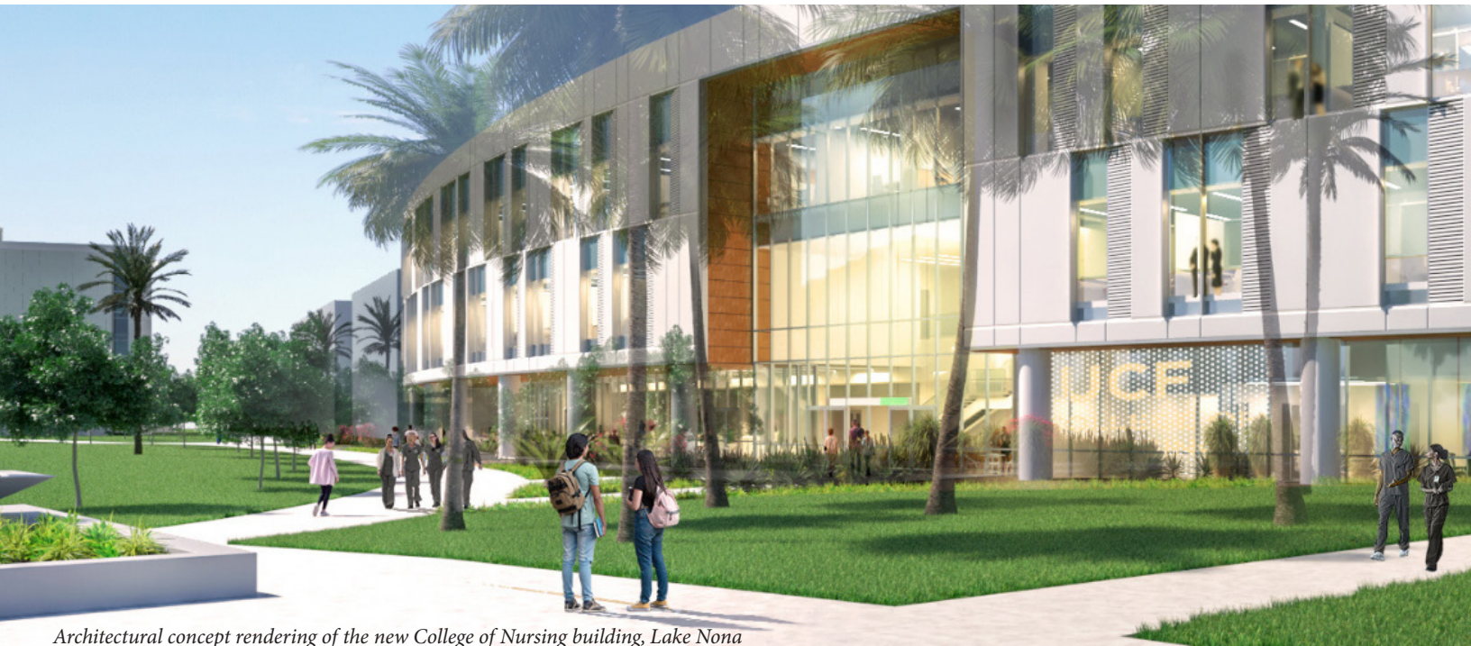
Architectural concept rendering of the new College of Nursing building, Lake Nona

The College of Nursing at the University of Central Florida (UCF) , a next-generation public research institution located in Orlando, Florida, invites applications for a 12-month position as the Assistant/Associate Dean for Academic Affairs . This position will be located on the UCF main campus and is expected to begin in Summer 2024. The position will relocate to the UCF Lake Nona campus following completion of a new facility in Fall 2025.