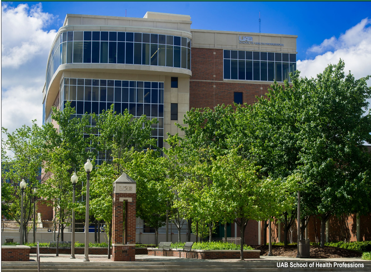
UAB School of Health Professions

UAB THE UNIVERSITY OF ALABAMA AT BIRMINGHAM.