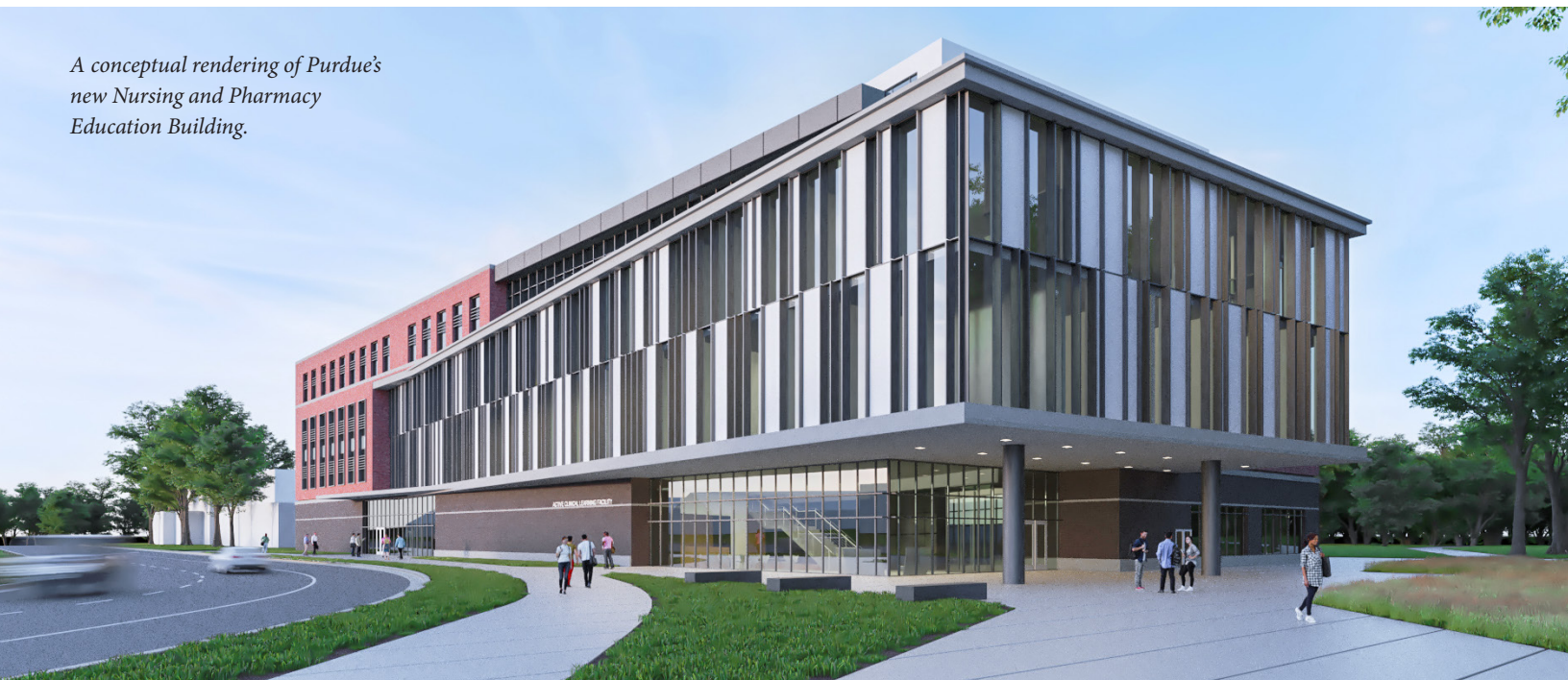
A conceptual rendering of Purdue's new Nursing and Pharmacy Education Building.

In November 2023, Purdue kicked off construction of the new Nursing and Pharmacy Education Building (NPEB) with a groundbreaking ceremony heralding