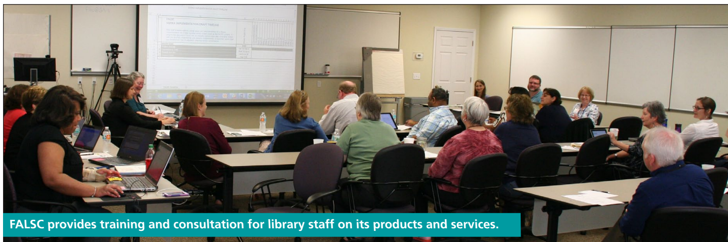
FALSC provides training and consultation for library staff on its products and services.

and market research, the Director creates strategies for the preservation and dissemination of digital archival materials, evaluates the feasibility of implementing new versions of digital platforms, and provides recommendations for the use and distribution of open-access textbooks and open educational resources.