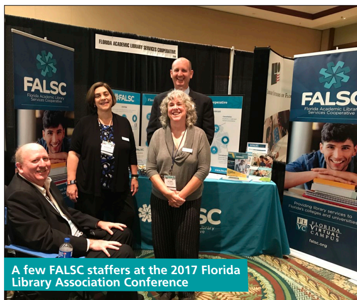
A few FALSC staffers at the 2017 Florida Library Association Conference

The city is about one hour from Florida's west coast and an hour and a half from its east coast. Gainesville Regional Airport offers non-stop service to Dallas, Texas; Charlotte, N.C., and Miami, Fla. Gainesville is also within about two hours from major Florida airports in Jacksonville, Orlando, and Tampa.