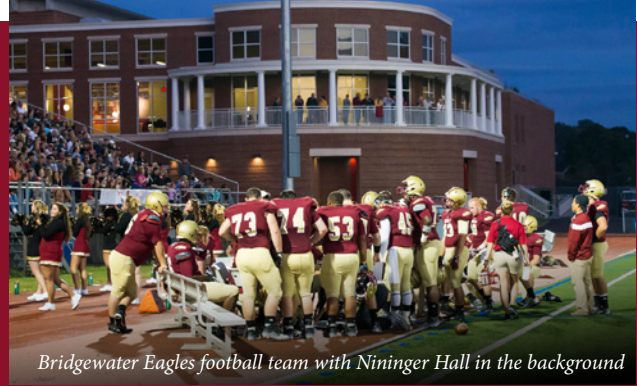
Bridgewater Eagles football team with Nininger Hall in the background

The Town of Bridgewater is home to 13 parks, an arboretum, and an ice skating rink. There are plenty of outdoor activities for every season close by: skiing, tubing, hiking, mountain biking, canoeing, kayaking,