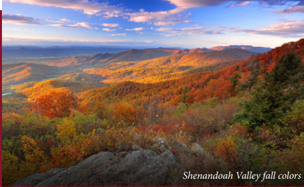
Shenandoah Valley fall colors