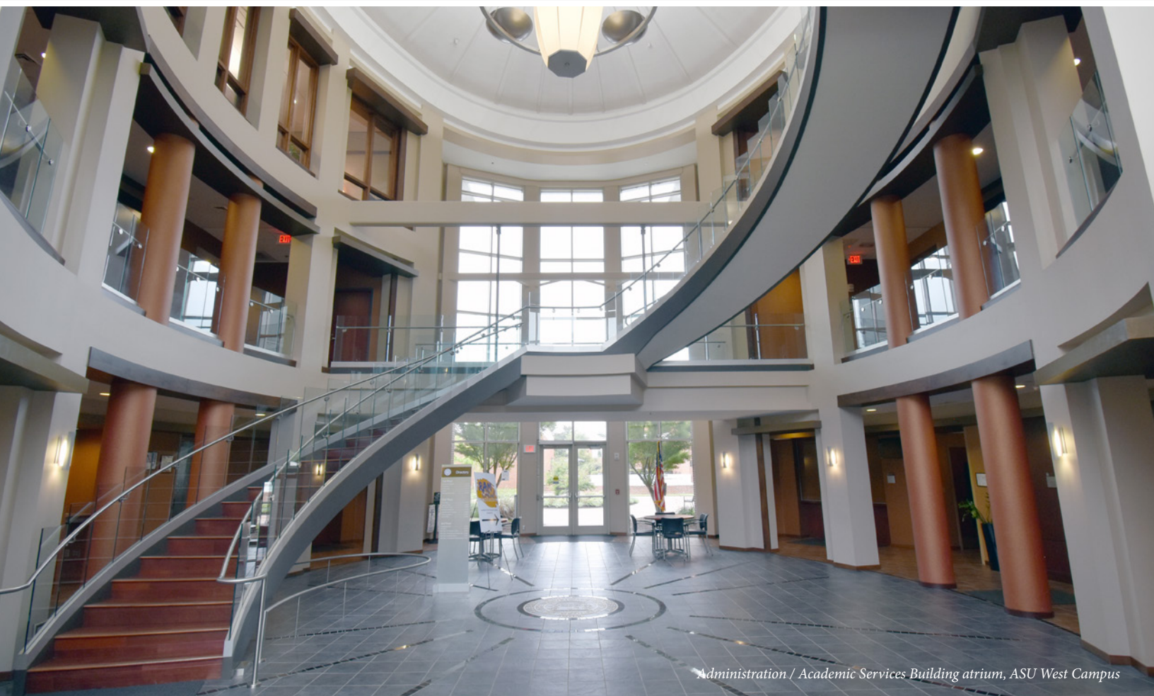
Administration / Academic Services Building atrium, ASU West Campus