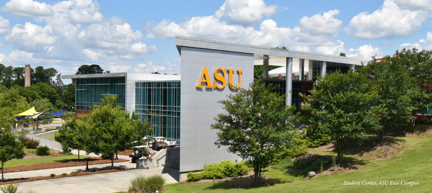
Student Center, ASU East Campus