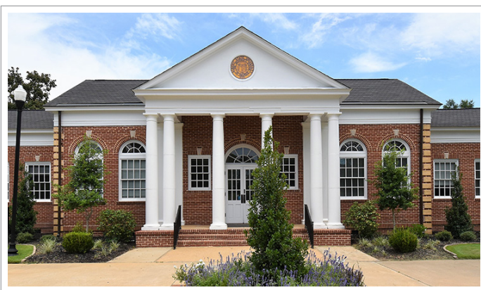
Daisy Brown Building, Office of the President, ASU East Campus