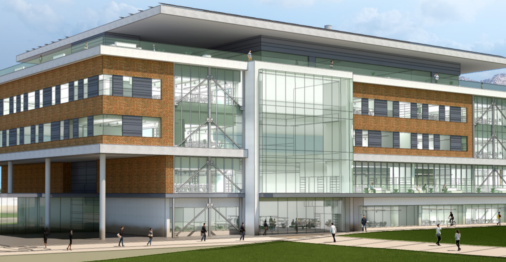
Architectural rendering of the new engineering building