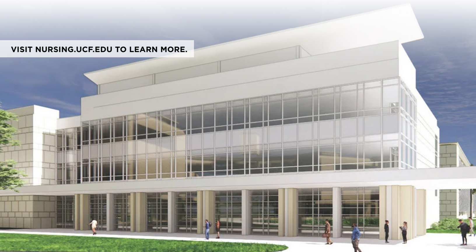
Architectural concept rendering of the new College of Nursing building, Lake Nona

Inviting Applications and Nominations for