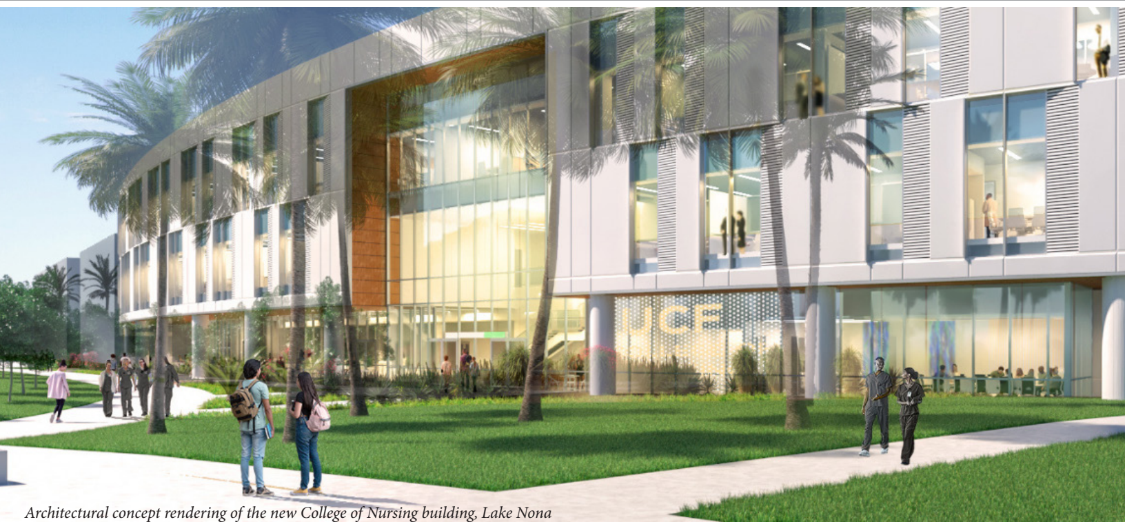
Architectural concept rendering of the new College of Nursing building, Lake Nona

The College of Nursing at the University of Central Florida (UCF) , a next-generation public research institution located in Orlando, Florida, invites applications for a 12-month, tenured professor position to serve as Chair for the Department of Nursing Practice . This position will be located on the UCF main campus and is expected to begin in Summer 2024. The position will relocate to the UCF Lake Nona campus following completion of a new facility in Fall 2025.