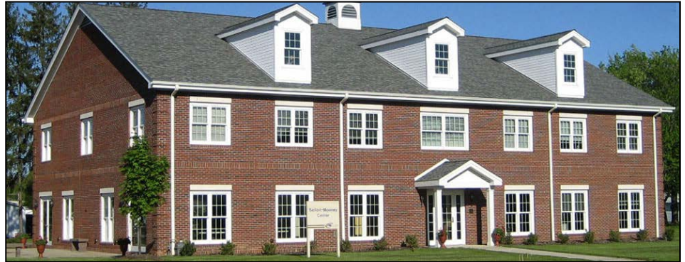
The Seifert-Mooney Center for the Advancement of Clarion University houses the offices of Advancement, Alumni Relations, Clarion University Alumni Association and Clarion University Foundation, Inc.

Capital of the World," Clarion is regarded as one of the top outdoor recreational areas in Pennsylvania. With a backdrop of rolling wooded hills, the Clarion community offers canoeing, horseback riding, and camping. For those who love winter activities, 12 miles of snowmobile